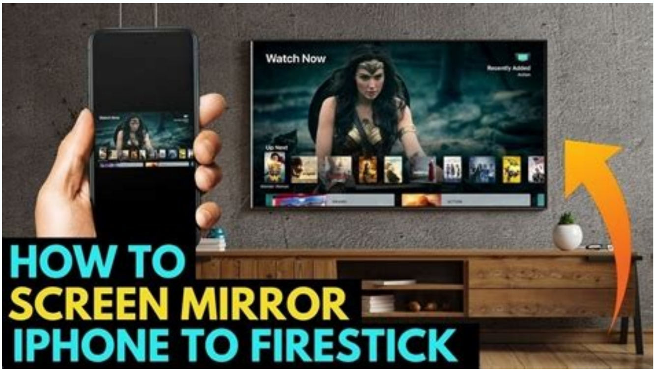
Can i mirror my ipad to a firestick. Can you screen mirror ipad to amazon fire stick. How to screen mirror from ipad to amazon fire stick. How do i screen mirror my ipad to my firestick. Screen mirror ipad pro to firestick.